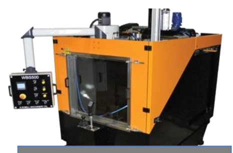
WBS Machines US$1,400 per service

MPS Machines US$1,000 per service (includes PCS20)