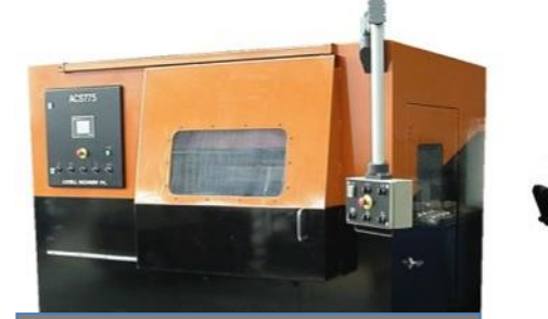
ACS Machines US$1,600 per service