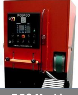
RGS Machines US$1,400 per service