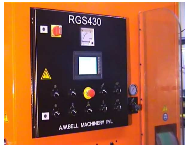
Actual results may vary